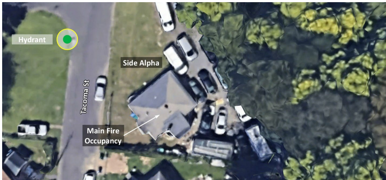
Figure 2. Aerial View