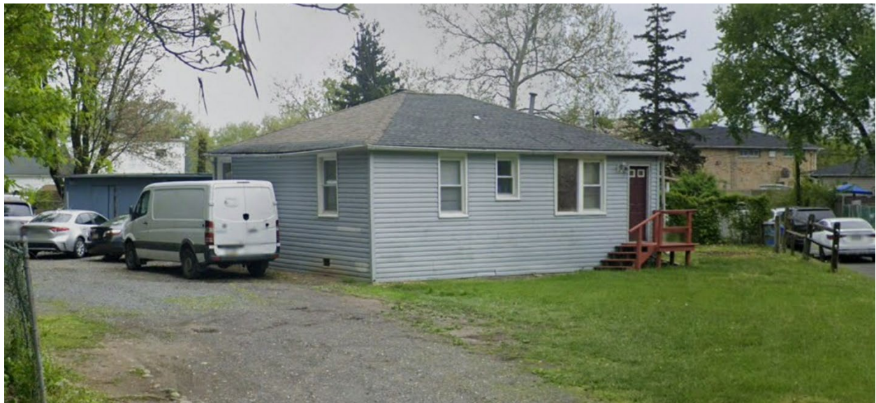
Figure 3. Alpha/Bravo Corner

Note: Adapted from Google. (2023c). [Street view, 1108 Tacoma Street, Bristol Township, PA]. https://bit.ly/3RKpliA .