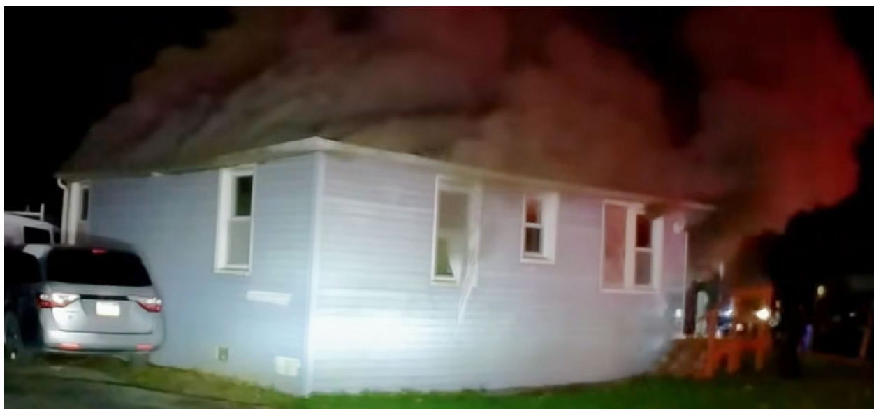
Figure 7. Conditions at the Door on Side Alpha

Note: Adapted from McGoldrick, H. (2023). 12-8-23 Tacoma Street basement fire Bristol Township, PA [video]. https://bit.ly/480Vloh