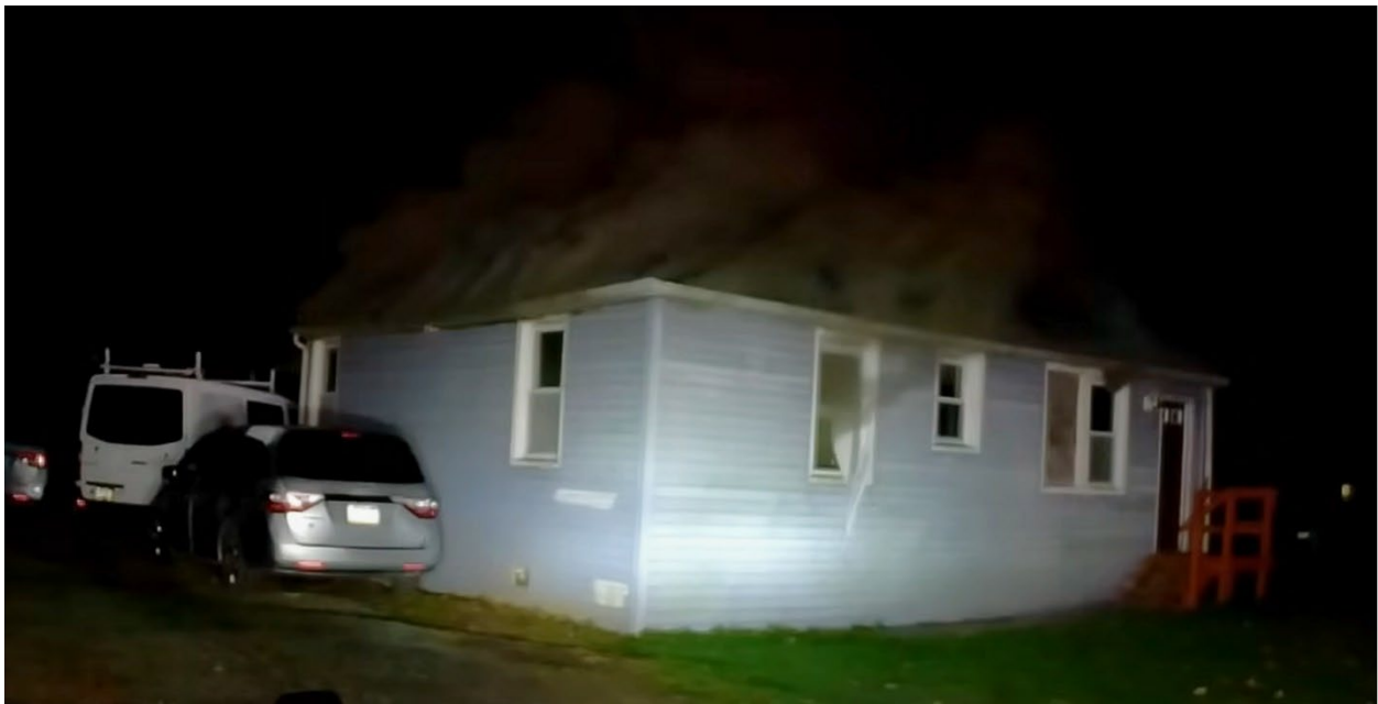
Figure 6. Conditions on Arrival

Note: Adapted from McGoldrick, H. (2023). 12-8-23 Tacoma Street basement fire Bristol Township, PA [video]. https://bit.ly/480Vloh