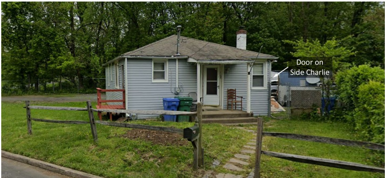
Figure 5. Side Delta