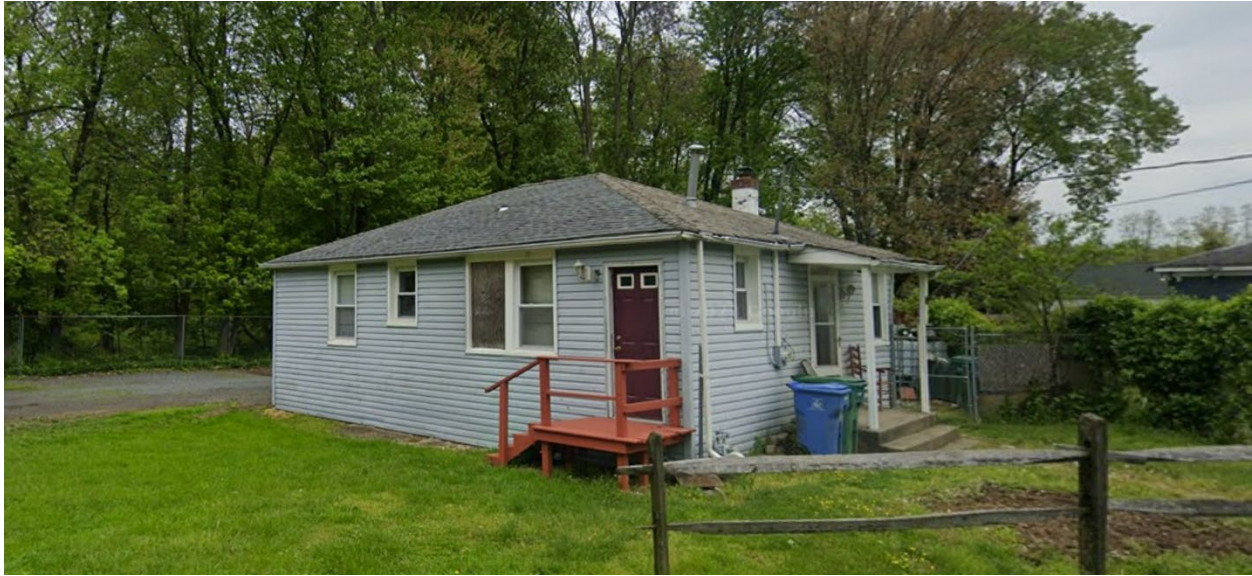
Figure 4. Alpha/Delta Corner