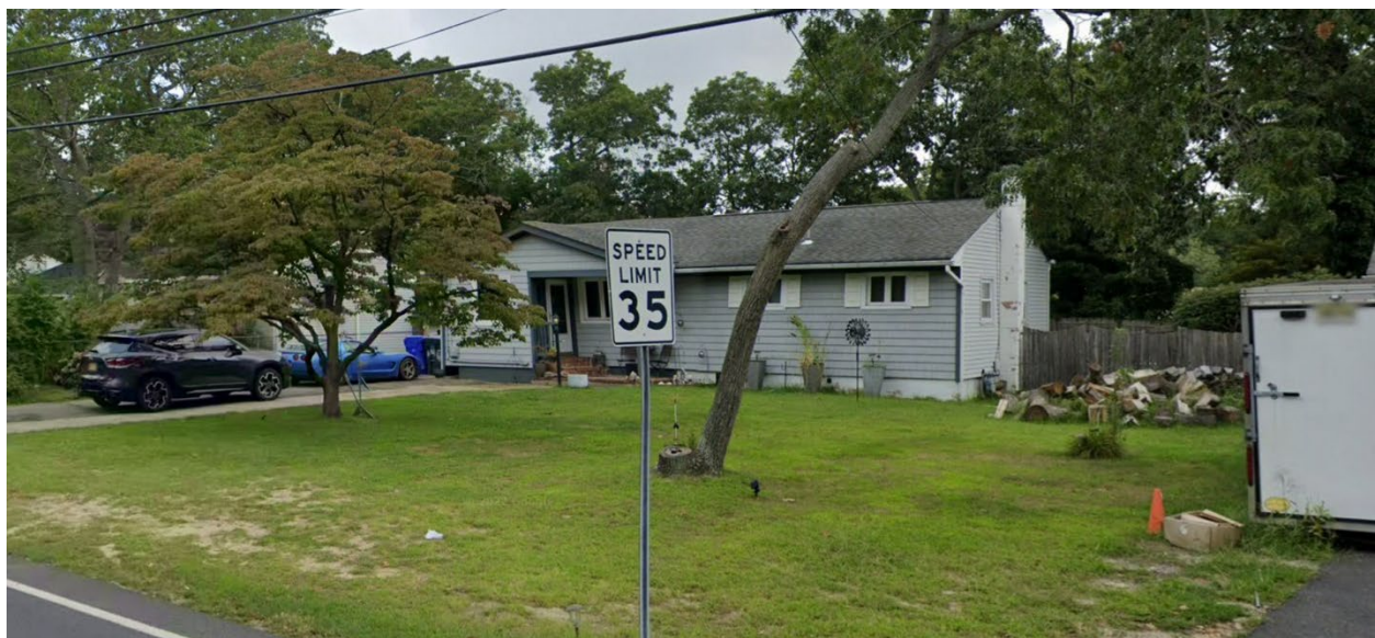
Figure 3. Alpha/Delta Corner