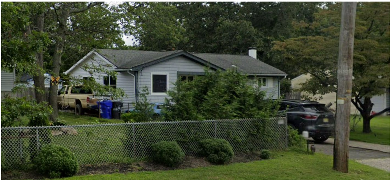
Figure 5. Alpha/Bravo Corner