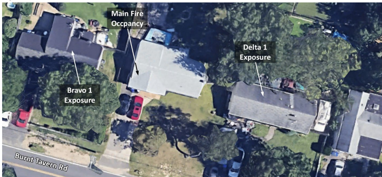
Figure 2. Aerial View

Note: Adapted from Google. (2024b). [Aerial view 53 Burnt Tavern Road, Brick, NJ]. https://bit.ly/4aNmsEg .