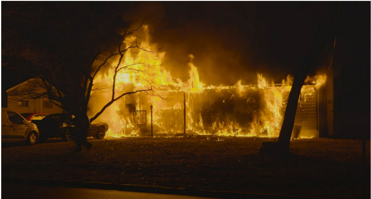
Figure 8. Conditions on Arrival

Note: Adapted from Jersey Shore Fire Response. (2024). Pre arrival fully involved structure fire Brick New Jersey 2/23/24 [video] https://bit.ly/49sH0ku .