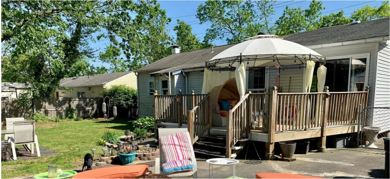
Figure 6. Side Charlie