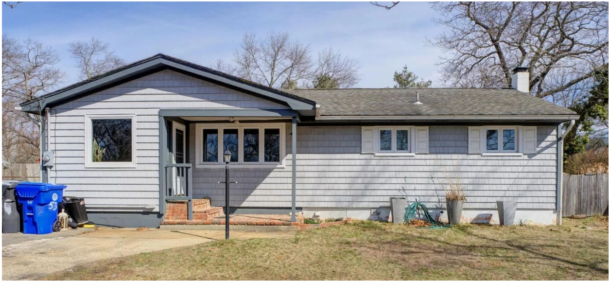
Figure 4. Side Alpha