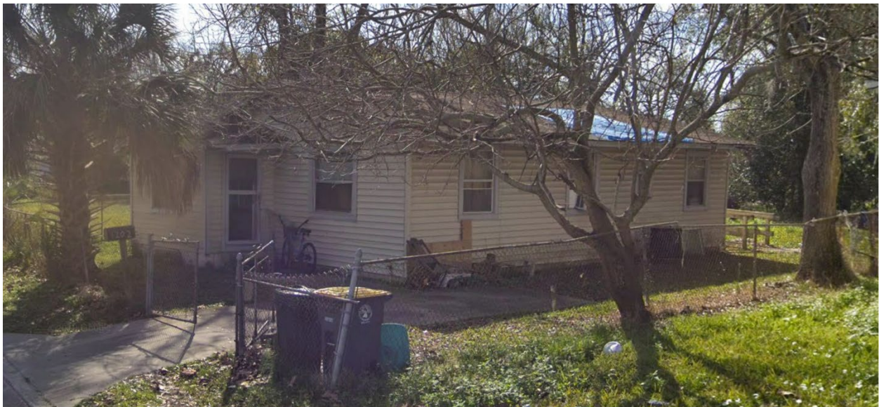
Figure 5. Side Charlie