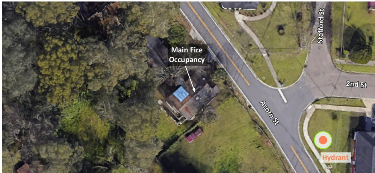
Figure 2. Aerial View

Note: Adapted from Google. (2024b). [Aerial view 1202 Acorn Street, Jacksonville, FL]. https://bit.ly/49r3ZfD .