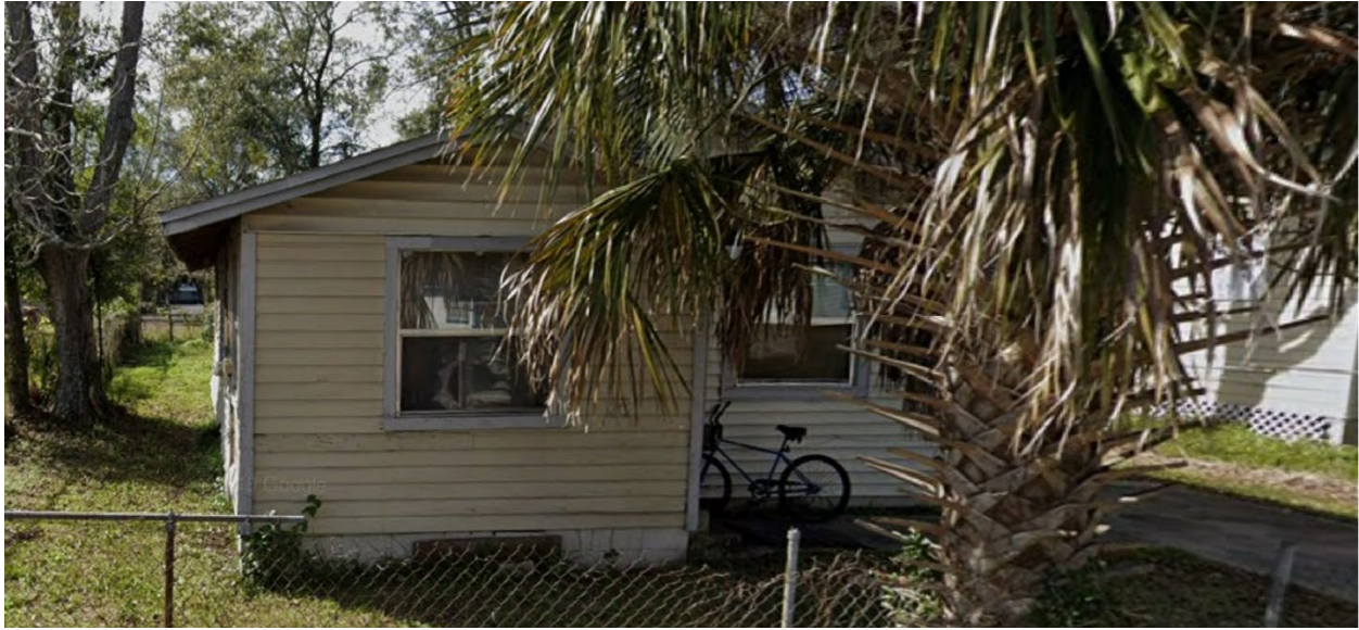
Figure 4. Side Alpha