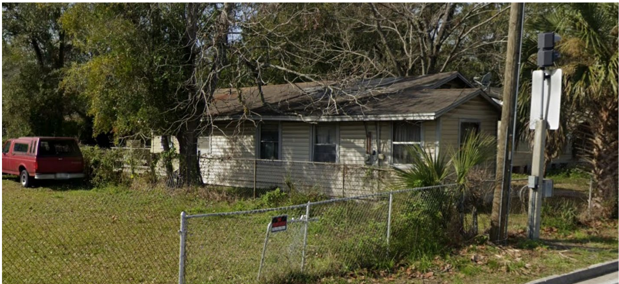
Figure 3. Alpha/Delta Corner