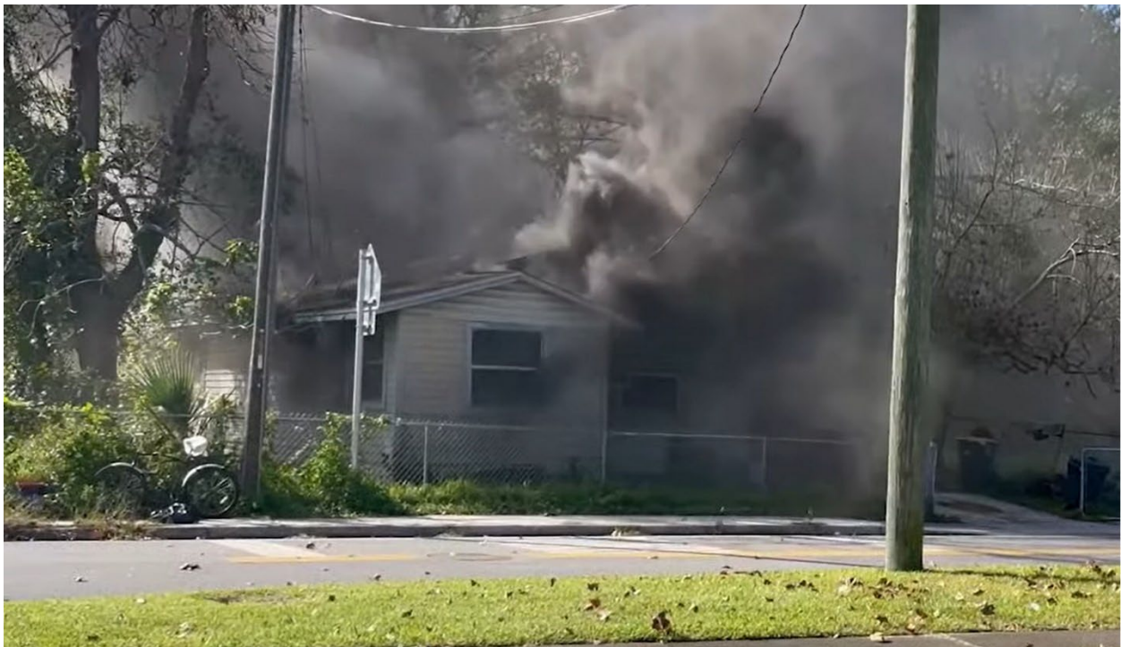
Figure 6. Conditions on Arrival

Note: Adapted from Jacksonville Fire Rescue Department (JFRD). (2020). Jacksonville Fire Rescue Department firefighters injured in house fire with reports of one inside [video]. https://bit.ly/3vljEJV