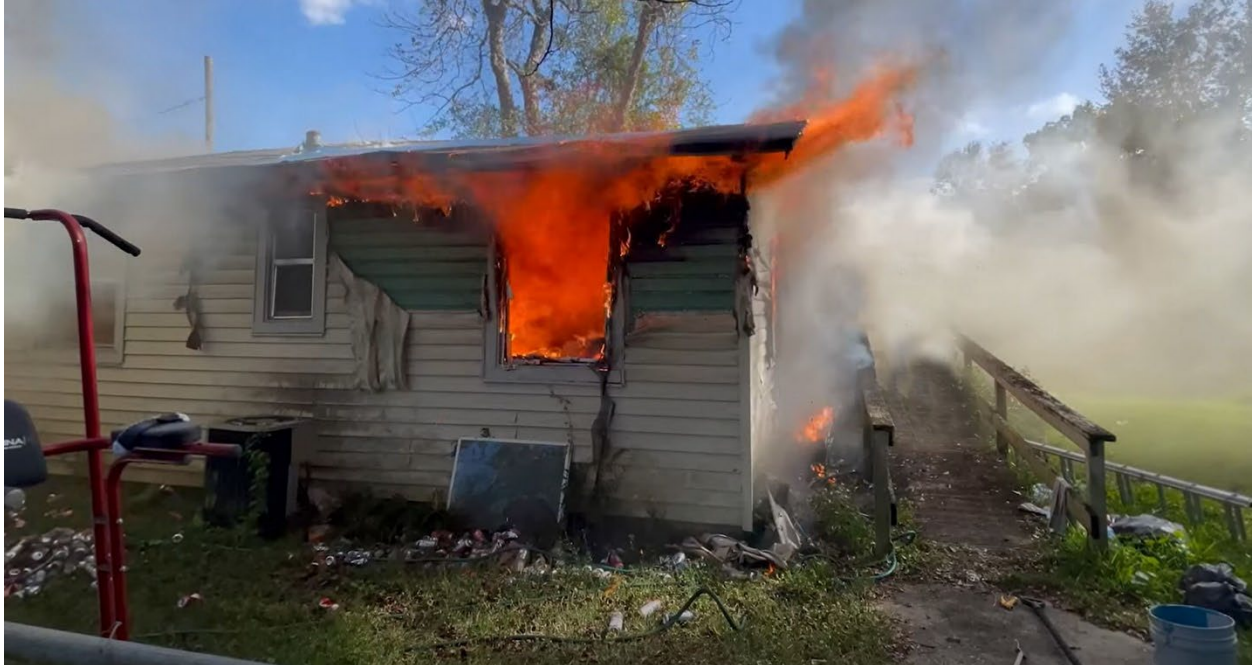
Figure 7. Bravo/Charlie Corner Shortly After Arrival

Note: Adapted from Jacksonville Fire Rescue Department (JFRD). (2020). Jacksonville Fire Rescue Department firefighters injured in house fire with reports of one inside [video]. https://bit.ly/3vIjEJV