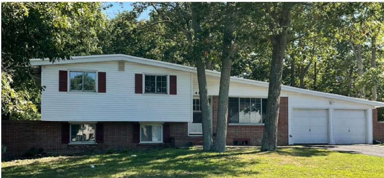
Figure 3. Side Alpha

Note: Adapted from hotpads. (2023). 419 Joe Parker Rd Lakewood, NJ 08701. https://bit.ly/4bO65l0 .