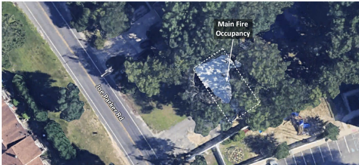
Figure 2. Aerial View