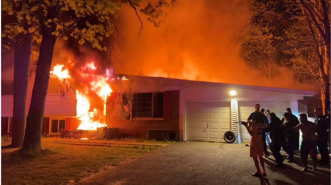
Figure 5. Conditions on Arrival

Note: Adapted from Jersey Shore Fire Response. (2024). Pre arrival bystanders rescue man fully involved house fire third alarm Lakewood New Jersey 5/4/24 [video]. https://bit.ly/3X0q1Dt