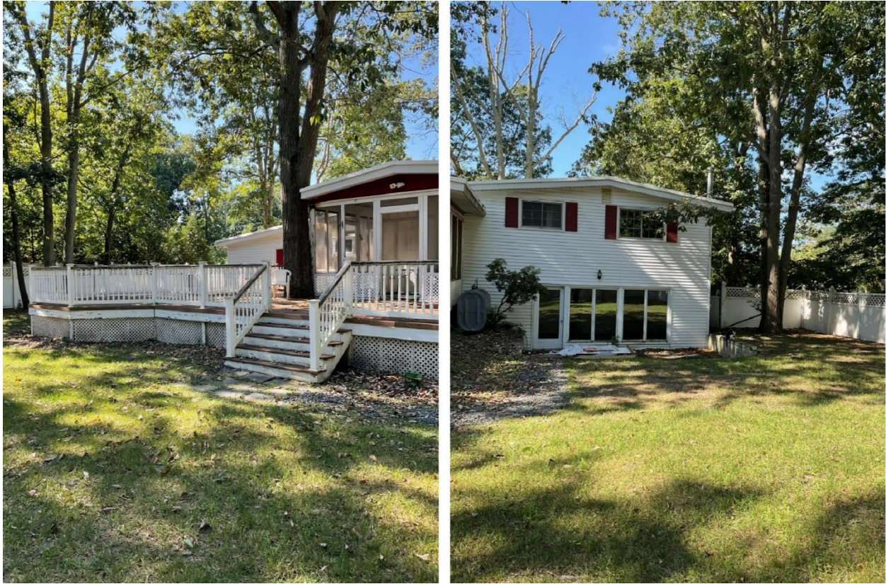
Figure 4. Side Charlie

Note: Adapted from hotpads. (2023). 419 Joe Parker Rd Lakewood, NJ 08701. https://bit.ly/4bO65l0 .