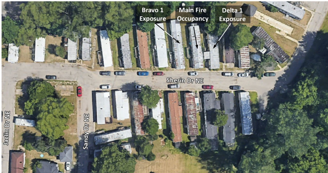
Figure 2. Aerial View

Note: Adapted from Google. (2024b). [Aerial view 1565 Sherin Drive NE, Grand Rapids, MI]. https://bit.ly/3yUnRf5 .