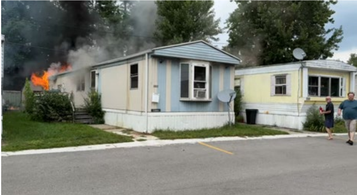
Figure 5. Conditions on Arrival

Note: Adapted from GWW09. (2024). Plainfield Township Engine 3 on scene mobile home fire 08/01/24 . https://bit.ly/4fTVkqD .