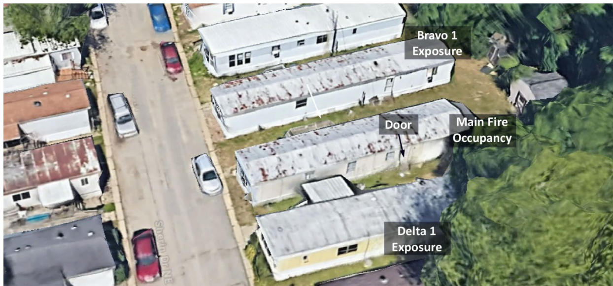
Figure 4. Side Delta