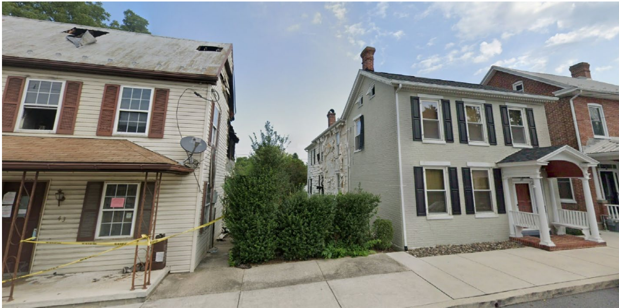
Figure 8. Exposure Delta 1 Post-Fire

Note: Adapted from Google. (2024d). [Street view 43 W Madison Street, Greencastle, PA]. https://bit.ly/3VPegWi .