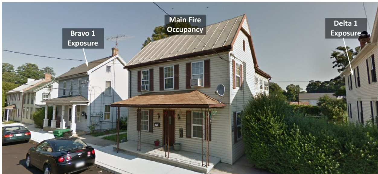
Figure 3. Alpha/Delta Corner

Note: Adapted from Google. (2012a). [Street view 43 W Madison Street, Greencastle, PA]. https://bit.ly/3Dq1VKJ .