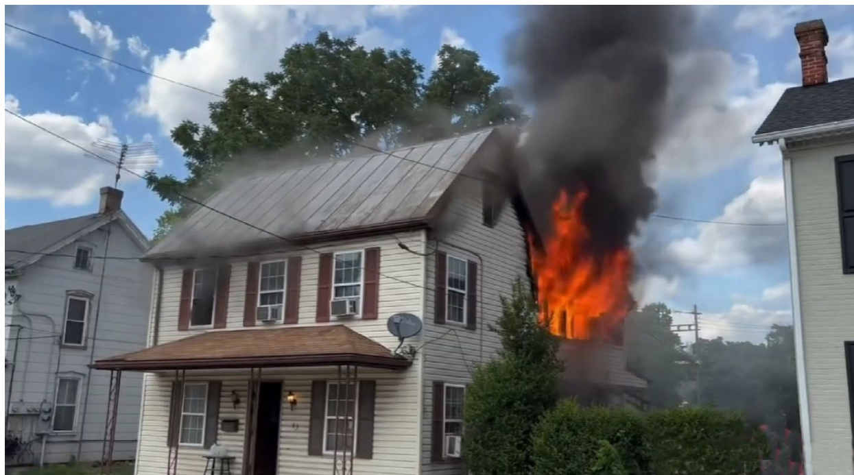
Figure 7. Conditions on Arrival

Note: Adapted from Scanner02. (2024). Pre-arrival of fire companies in Franklin County, Borough of Greencastle, PA [video]. https://bit.ly/3BAejqZ