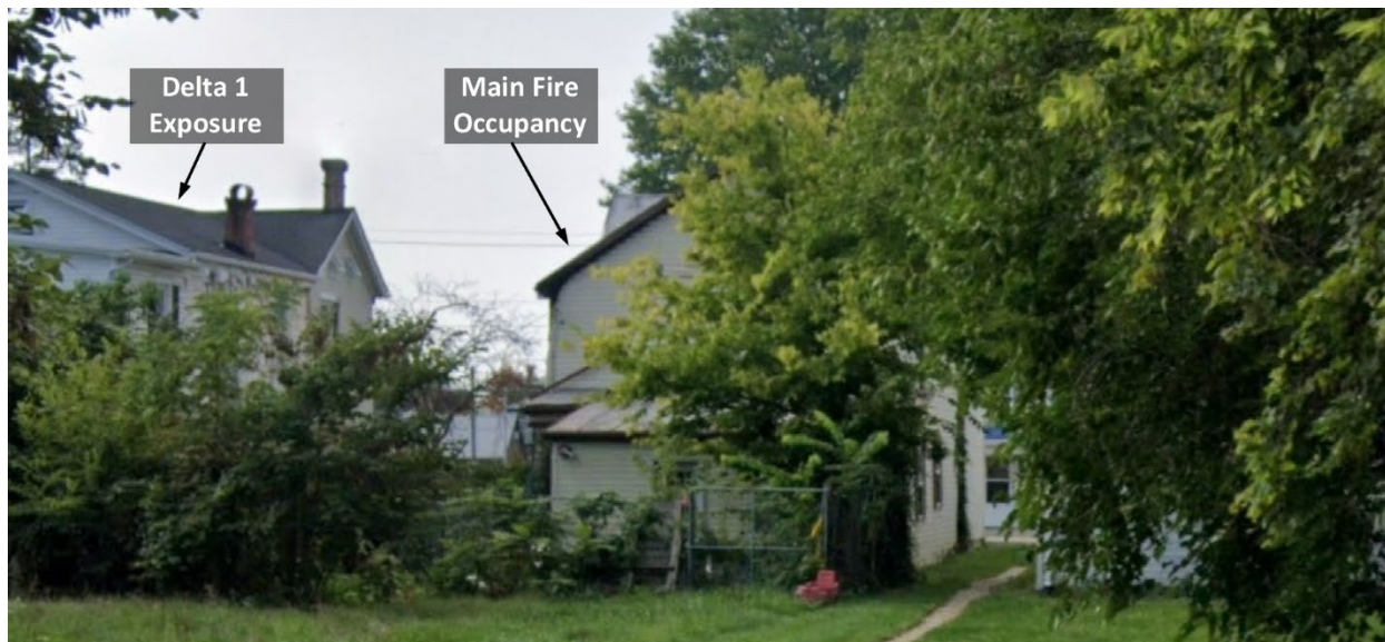
Figure 6. Bravo/Charlie Corner