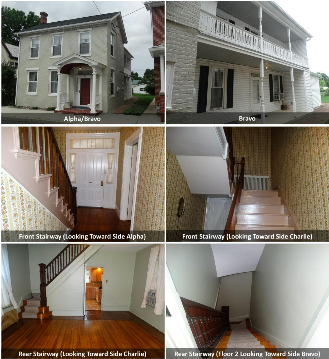
Figure 9. Delta 1 Exposure Exterior and Interior