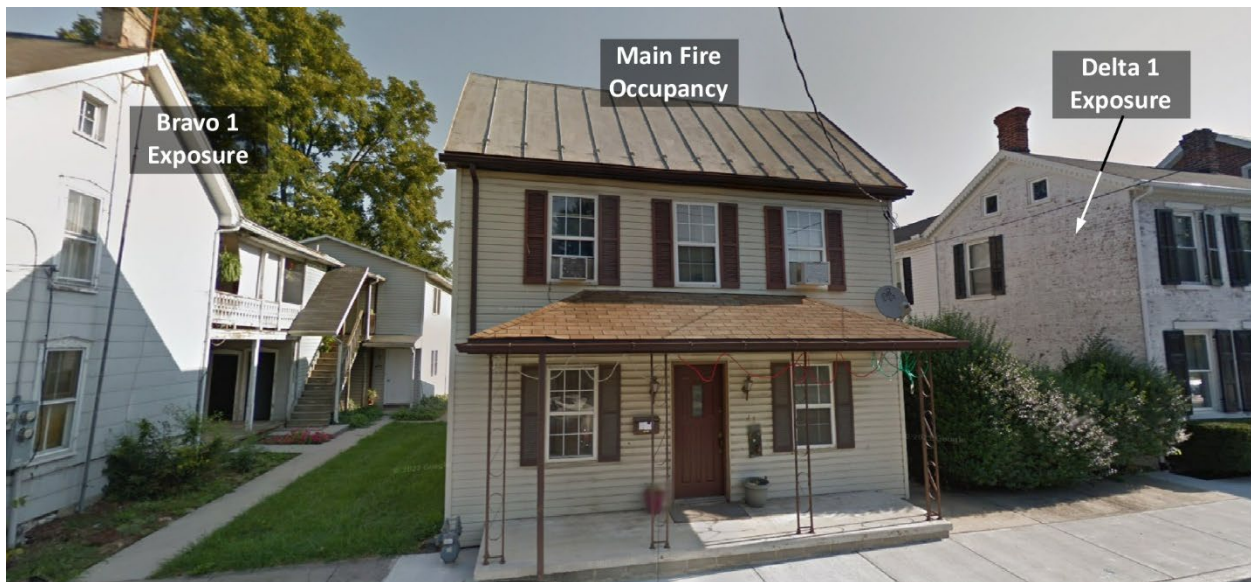
Figure 4. Side Alpha

Note: Adapted from Google. (2012b). [Street view 43 W Madison Street, Greencastle, PA]. https://bit.ly/3BtYYix .