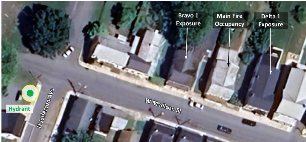
Figure 2. Aerial View

Note: Adapted from Google. (2024b). [Aerial view 43 W Madison Street, Greencastle, PA]. https://bit.ly/3ZP5j9m .