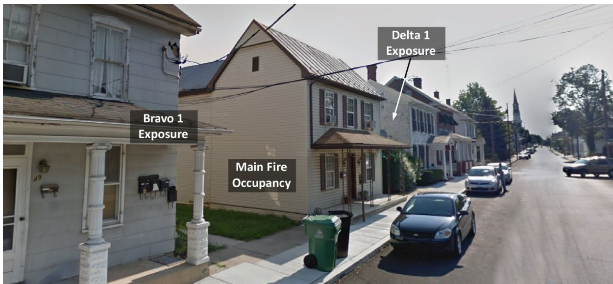
Figure 5. Alpha/Bravo Corner

Note: Adapted from Google. (2012c). [Street view 43 W Madison Street, Greencastle, PA]. https://bit.ly/3P66IU7 .