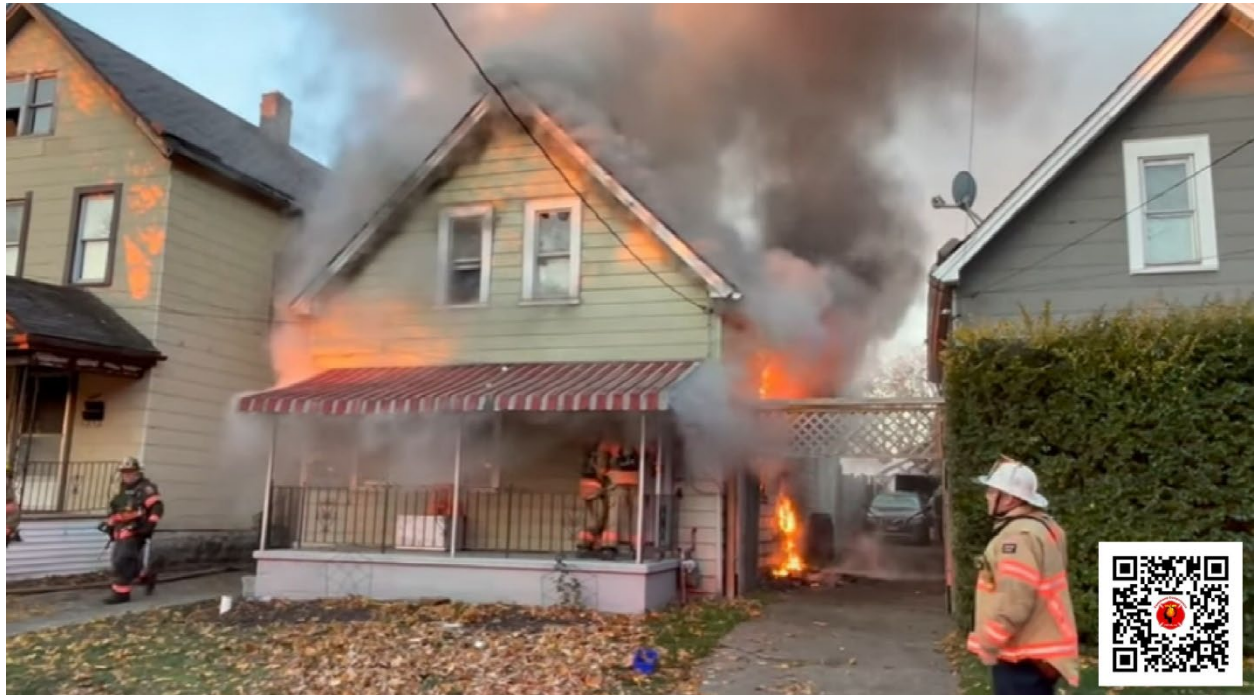
Figure 6. Conditions on Arrival

Note: Adapted from Fire Buff New York-FBNY. (2025). 11/20/25-Buffalo FD working fire at 18 Benzinger Street [video]. Retrieved, December 6, 2025, from https://bit.ly/4pVTolD .