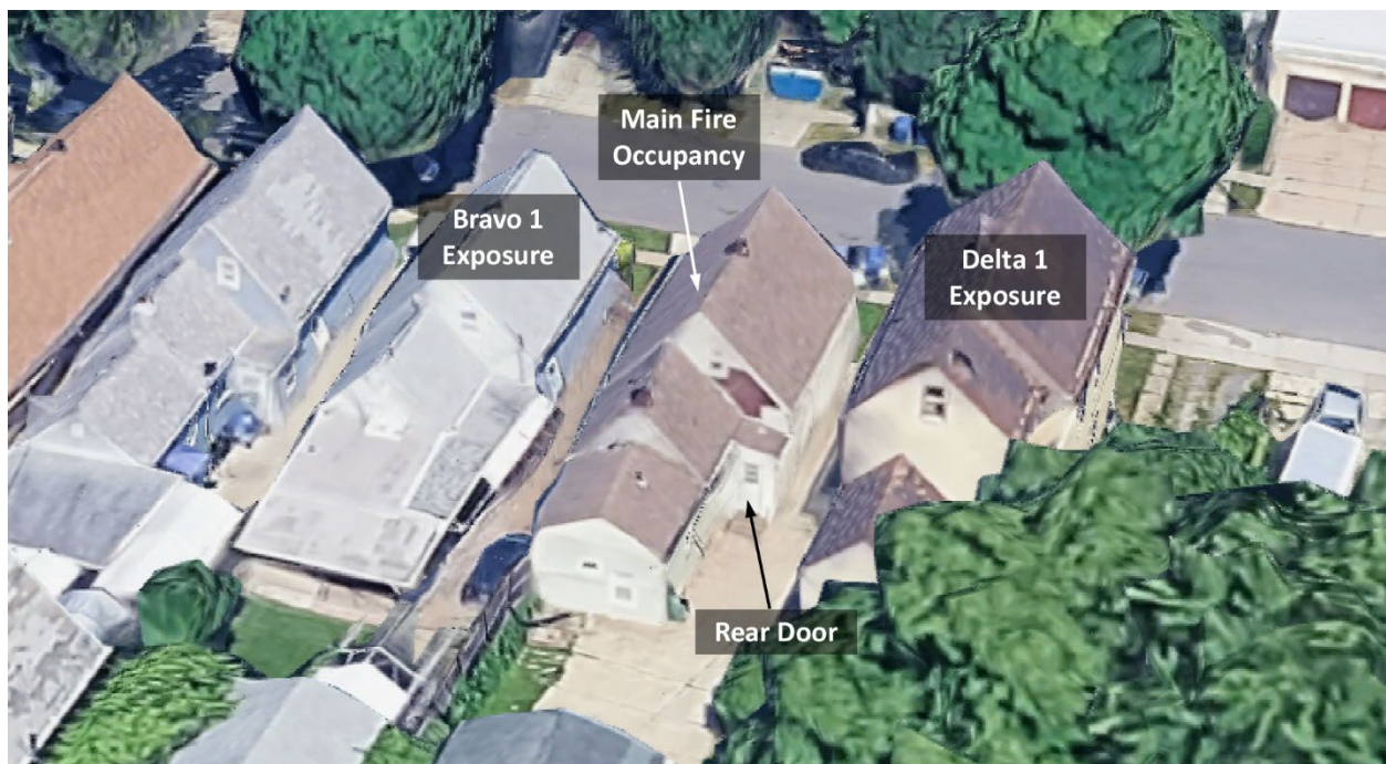
Figure 5. Bravo/Charlie Corner 3D Aerial View

Note: Adapted from Google. (2025e). [3d aerial view 18 Benzinger Street, Buffalo, NY]. Map data ©2025 Google https://bit.ly/4rl6q7V .