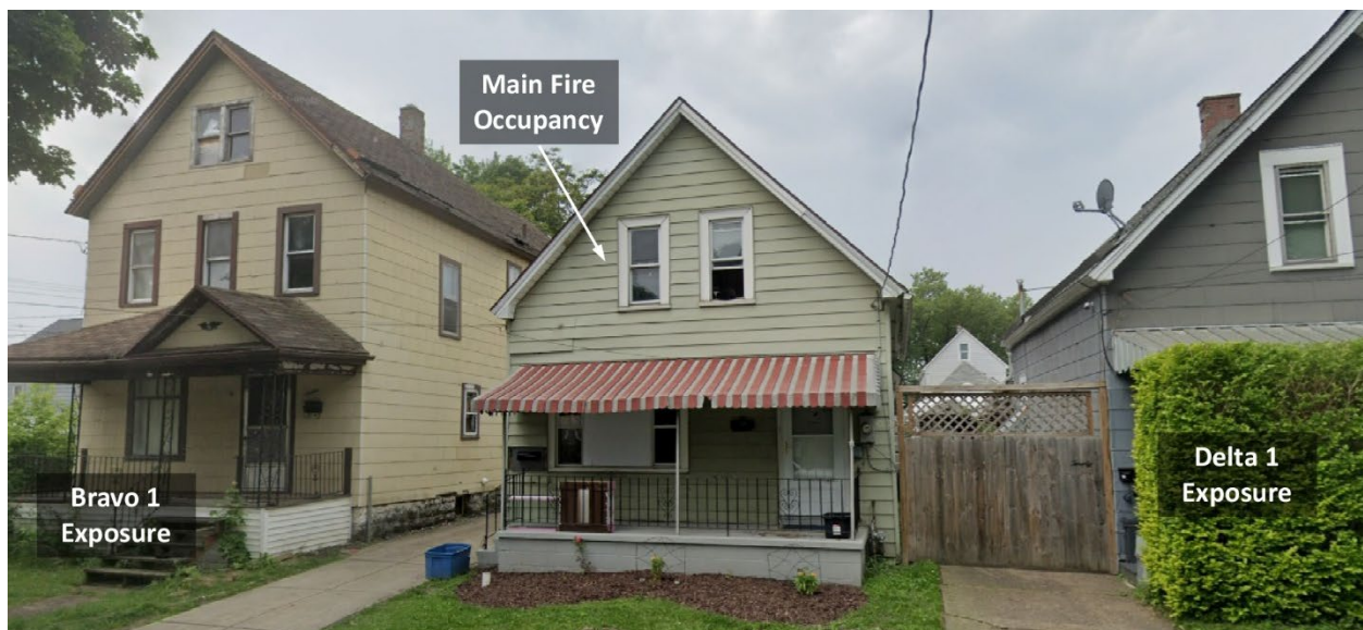
Figure 3. Side Alpha