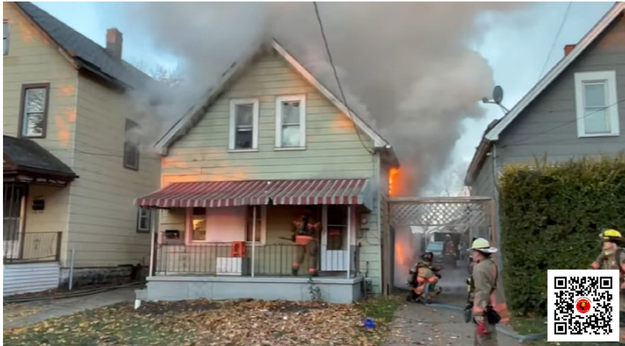
Figure 7. Changing Conditions

Note: Adapted from Fire Buff New York-FBNY. (2025). 11/20/25-Buffalo FD working fire at 18 Benzinger Street [video]. Retrieved, December 6, 2025, from https://bit.ly/4pVTolD .