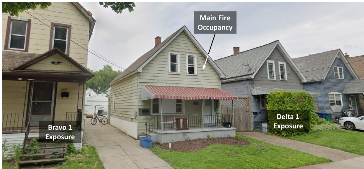
Figure 4. Alpha/Bravo Corner

Note: Adapted from Google. (2025d). [Street view 18 Benzinger Street, Buffalo, NY]. ©2025 Google https://bit.ly/4psifBS .