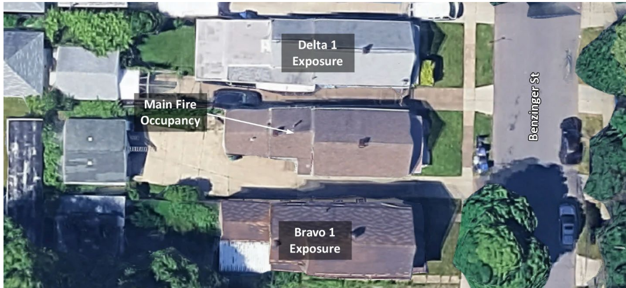
Figure 2. Aerial View

Note: Adapted from Google. (2025b). [Aerial view 18 Benzinger Street, Buffalo, NY]. Imagery © Google, Imagery © Airbus Maxar Technologies, Map Data © 2025. https://bit.ly/44MOhvV .