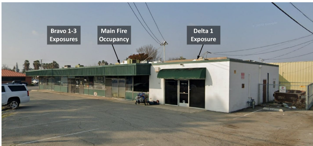
Figure 3. Alpha/Delta Corner

Note: Adapted from Google. (2022a). [Street view 22nd Street and F Street, Bakersfield, CA]. ©2025 Google. https://bit.ly/3PvGcgy .