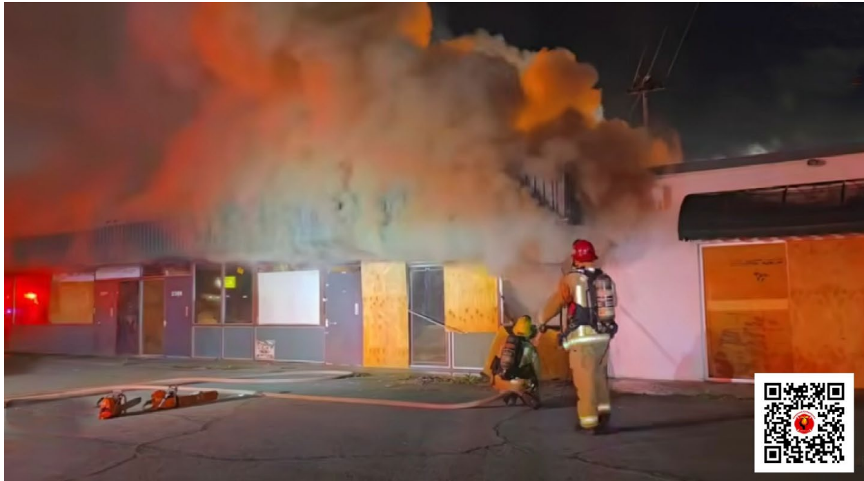
Figure 8. Conditions on Arrival

Note: Adapted from Barraza, B. (2026). Fatal second-alarm commercial structure fire In Central Bakersfield . https://bit.ly/4sGNKVZ .