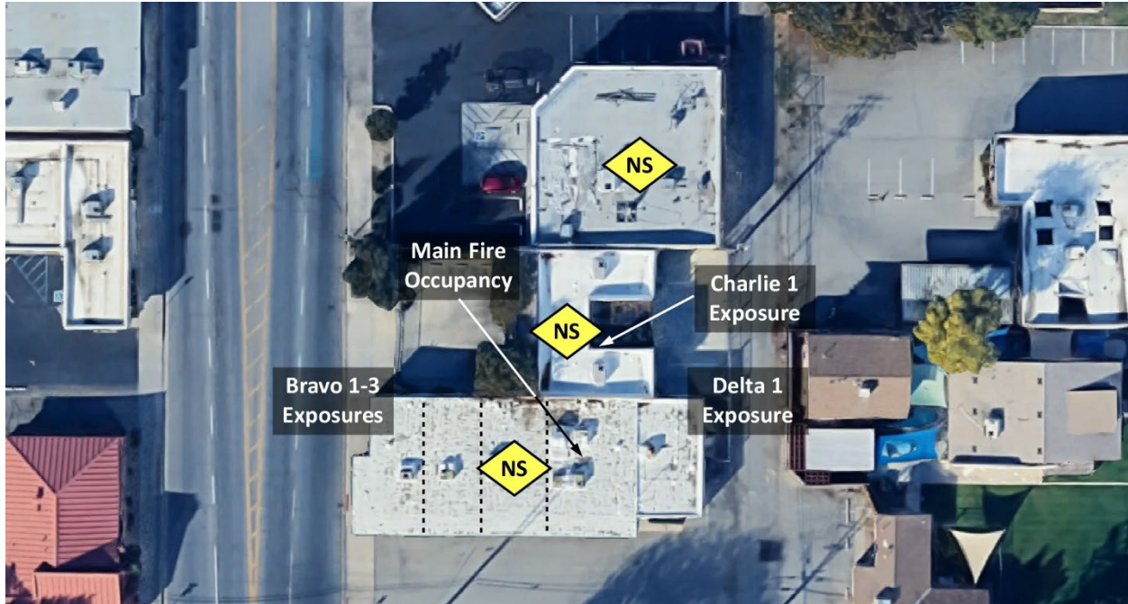
Figure 2. Aerial View

Note: Adapted from Google. (2026b). [Aerial view 22nd Street and F Street, Bakersfield, CA]. Imagery © Google, Imagery © Airbus Maxar Technologies, Map Data © 2026. https://bit.ly/46P8X7K .