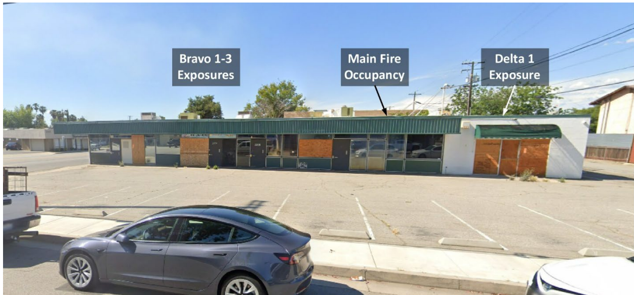
Figure 4. Side Alpha

Note: Adapted from Google. (2022b). [Street view 22nd Street and F Street, Bakersfield, CA]. ©2025 Google https://bit.ly/4s6cMxX .