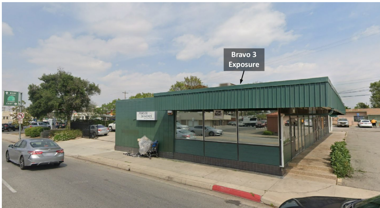
Figure 5. Side Bravo

Note: Adapted from Google. (2022c). [Street view 22nd Street and F Street, Bakersfield, CA]. Map data ©2025 Google https://bit.ly/46X5cNu .