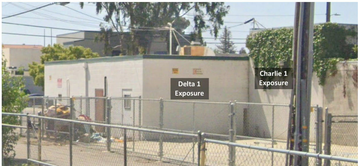
Figure 7. Charlie/Delta Corner

Note: Adapted from Google. (2022e). [Street view 22nd Street and F Street, Bakersfield, CA]. Map data ©2025 Google https://bit.ly/4cLb6oO .